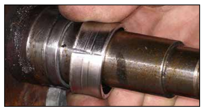
2. Once the press-fit bond of the wear sleeve has been broken, remove the old wear sleeve from the spindle