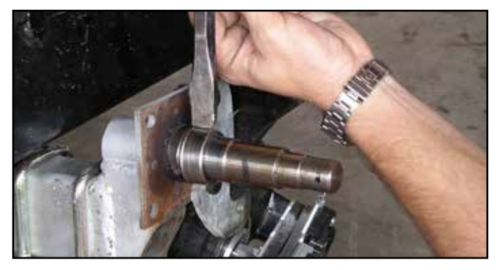
1. Remove hub unit from spindle. Use a large sized and sharpened chisel to split open wear sleeve. Try not to chisel into the spindle; if possible, only chisel into the wear sleeve. Wear sleeve should spring open.